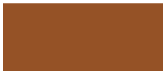
920 TERRA COTTA